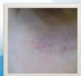
CLINICAL IMPROVEMENT IN SCAR TISSUE